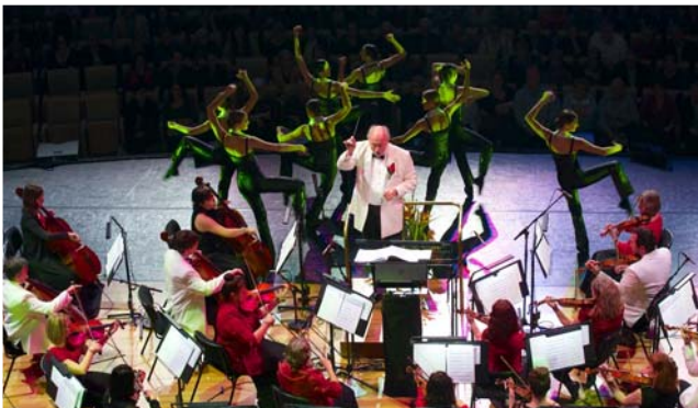
Moreton Bay College Dancers