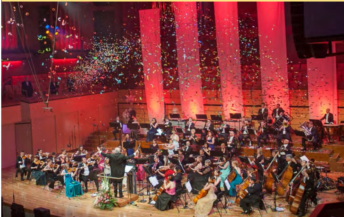
30th Anniversary Concert