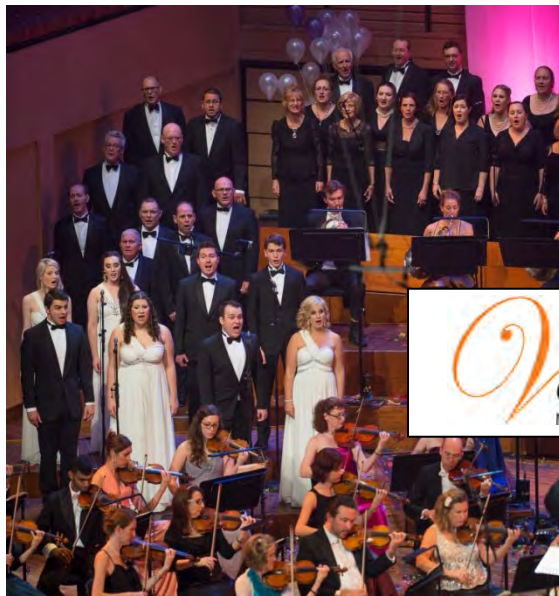
Queensland Festival Chorus