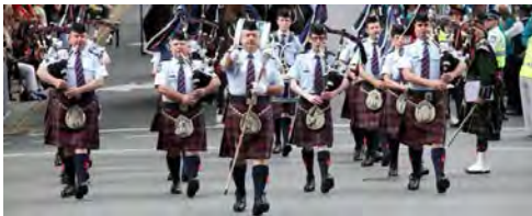
Queensland Police Pipes & Drums

You must be a financial member of the Friends to purchase this ticket deal.